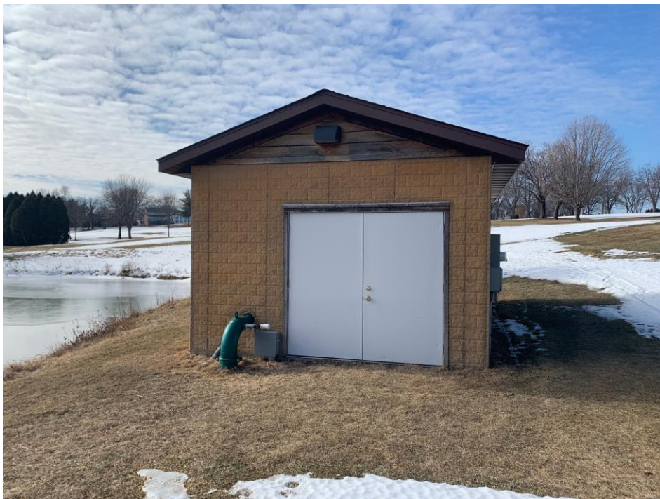
Figure 7. Pump house at Palmer Hills golf course.