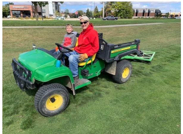
Figure 30. Brushing greens helps remove grain and improves ball roll.