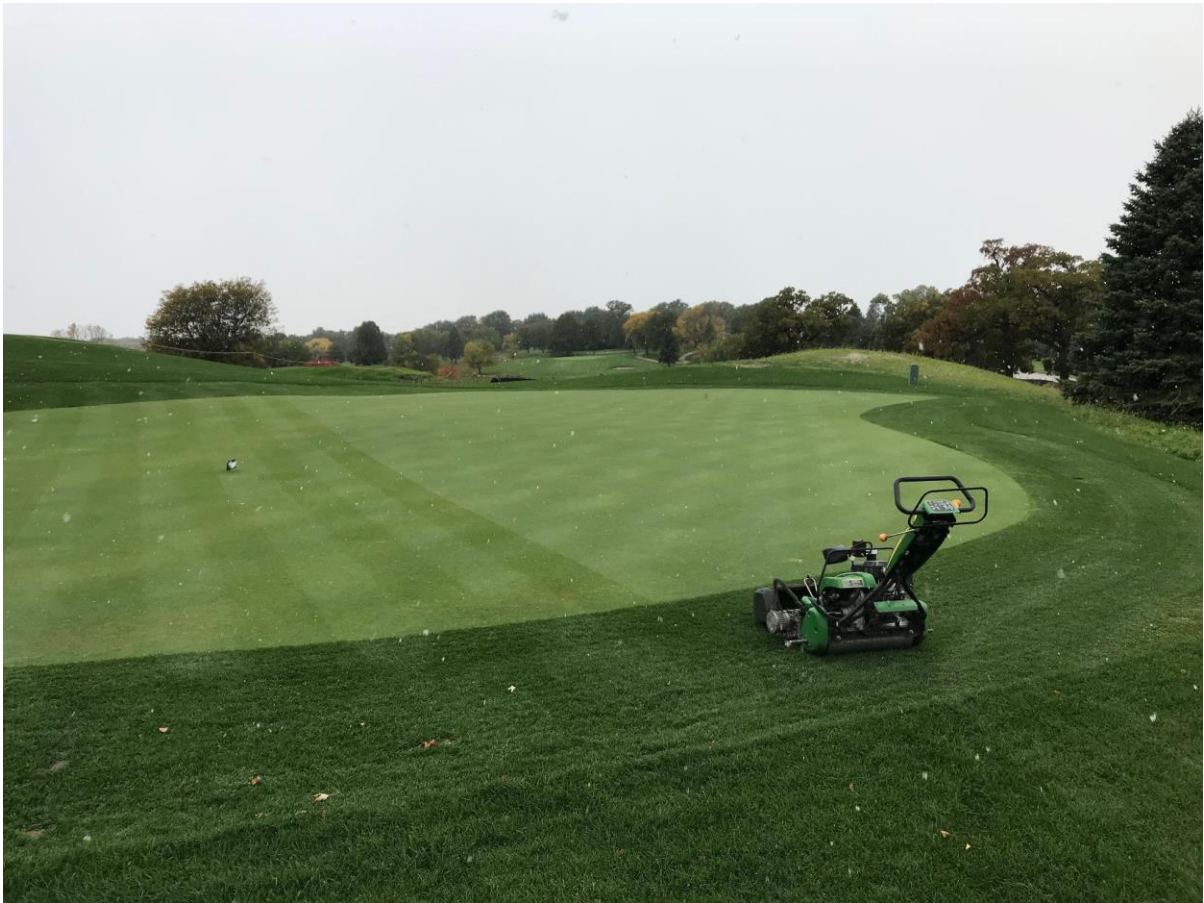
Figure 26. Walking greensmower on putting green, mowing in the snow.