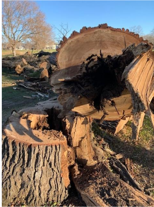
Figure 31. Tree management involves removing dead or decaying trees.