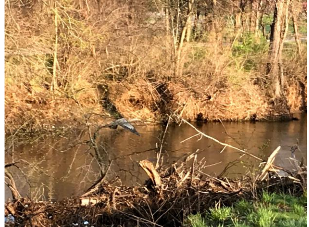
Figure 19. Naturalized creek at Palmer Hills with Blue Heron