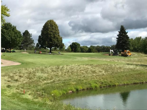
Figure 18. Buffer zone around 14/17 pond at Palmer Hills