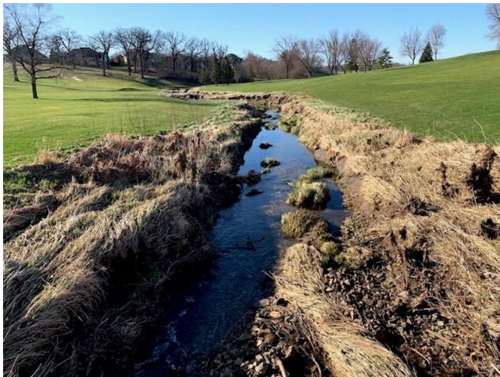
Figure 16. Riparian zone along Stafford Creek to filter fertilizer and chemicals