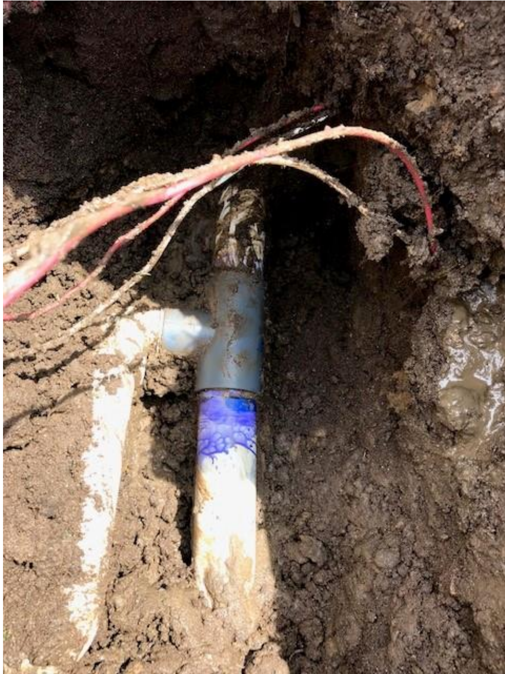
Figure 11. Irrigation repair at Palmer Hills golf course.