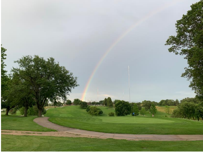
Figure 34. The beauty of a 150 acre golf course in the heart of the City of Bettendorf