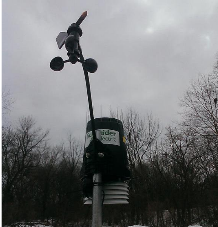
Figure 14. Weather stations can be your eyes and ears when you aren't around.