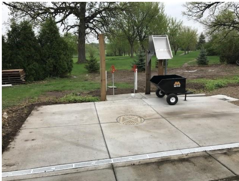
Figure 48. Designated wash area with grass clipping strainer and cart.