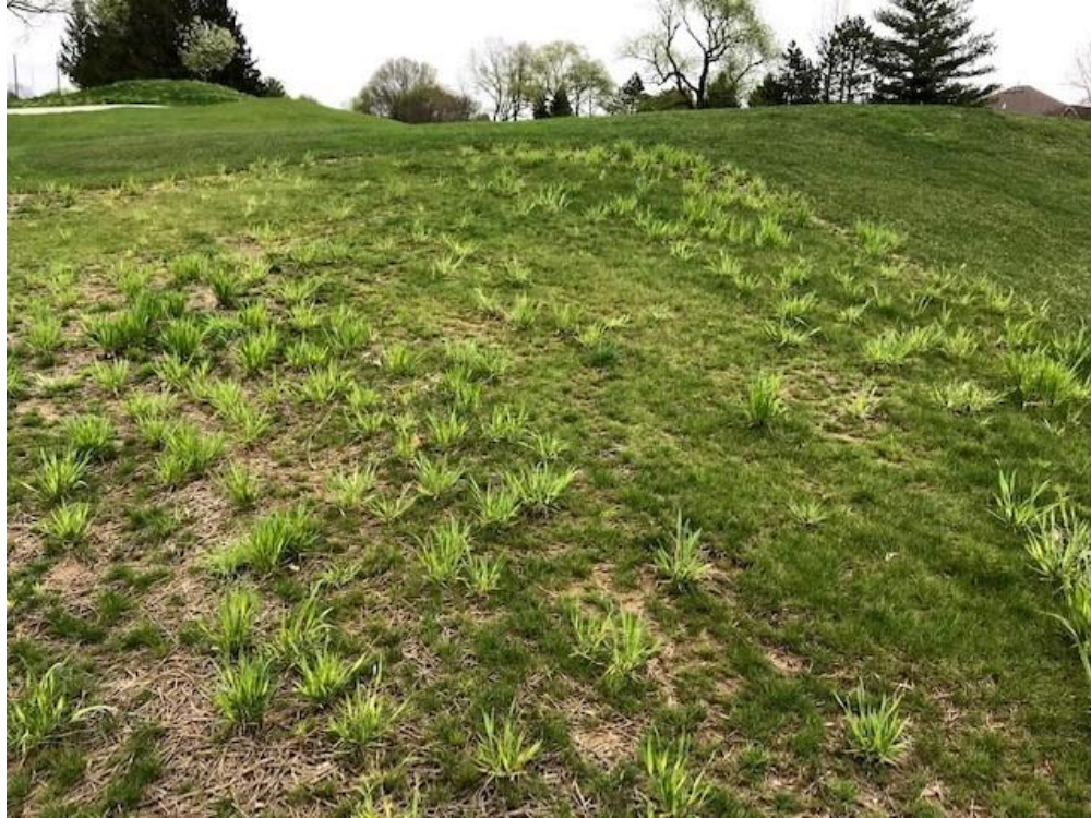
Figure 39. Weeds invading newly planted fine fescue rough