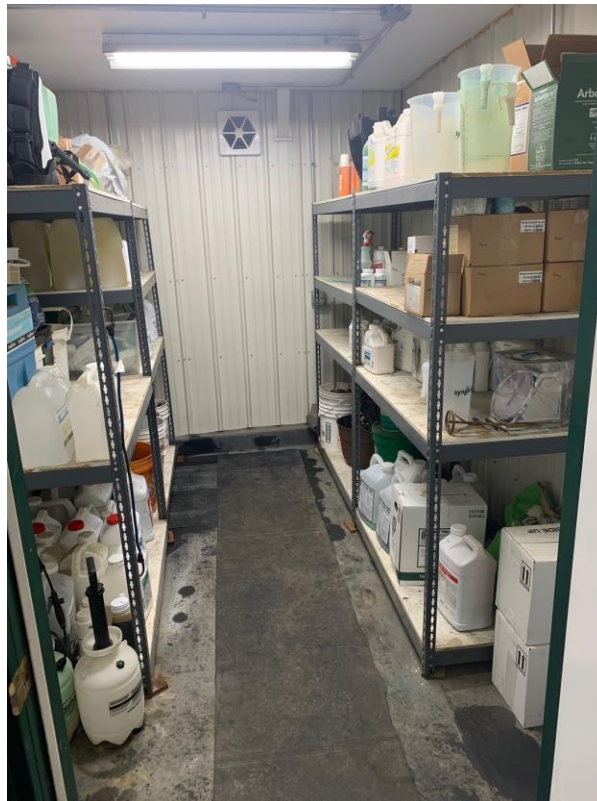
Figure 40. Chemical storage should be secure and organized.