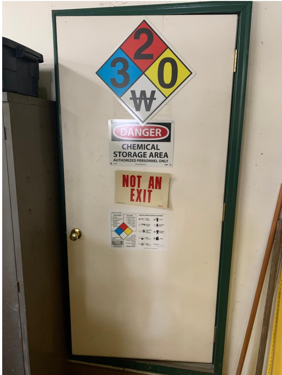
Figure 46. Proper chemical storage.