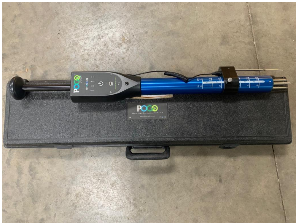
Figure 10. Pogo moisture meter used to measure soil moisture and determine irrigation amounts.