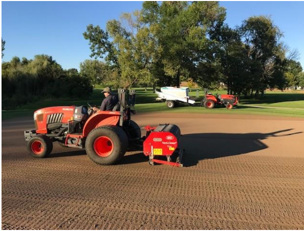
Figure 27. Deep-tine aeration on putting greens