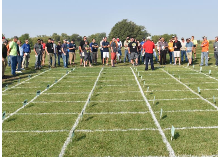
Figure 36. NTEP trials can show you what can work best for you.