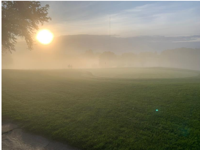
Figure 33. Sunrise at Palmer Hills.