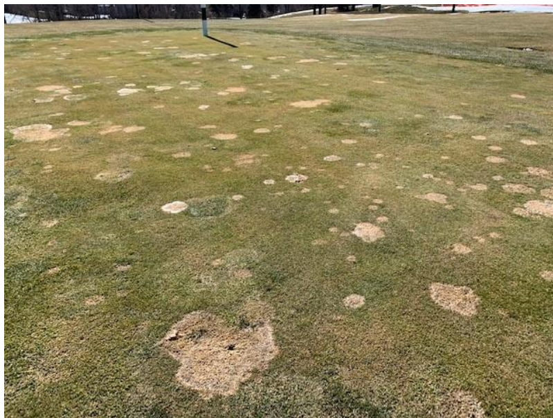
Figure 38. Snow mold disease on driving range target greens