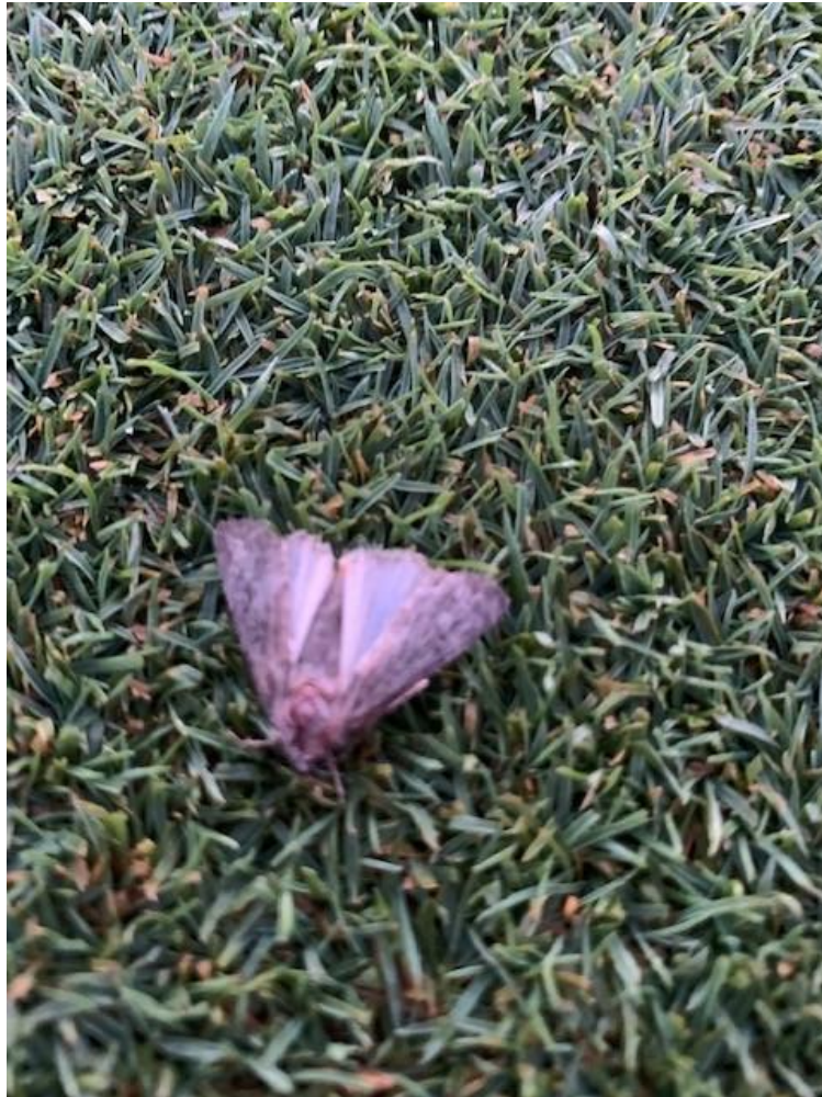
Figure 35. Adult Fall Army Worm moth