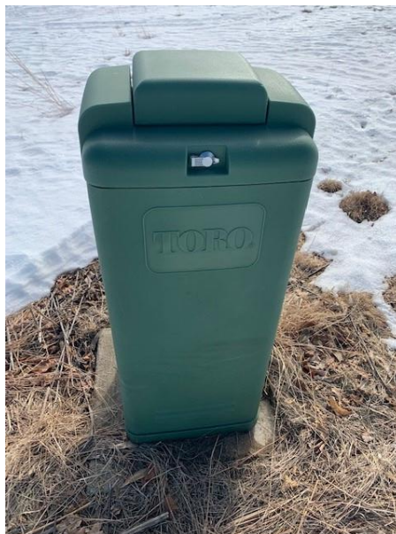
Figure 8. Satellite controller on hole 17, Palmer Hills golf course.