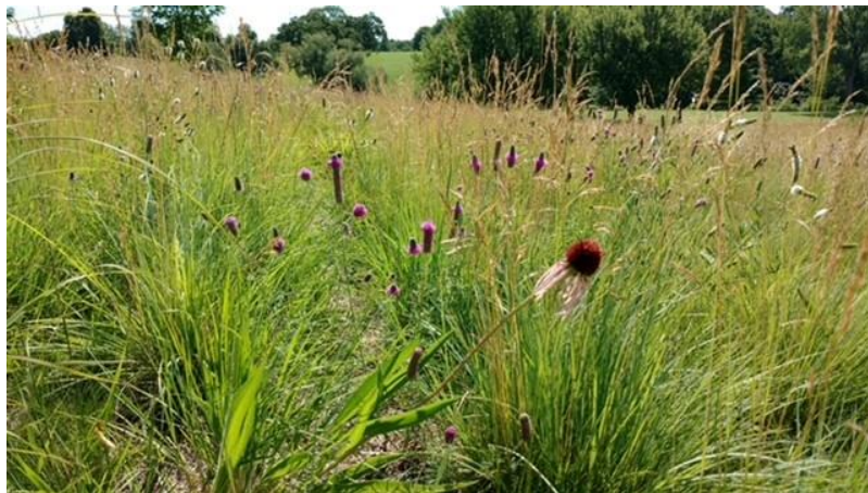
Figure 37. Bees can thrive on a golf course.