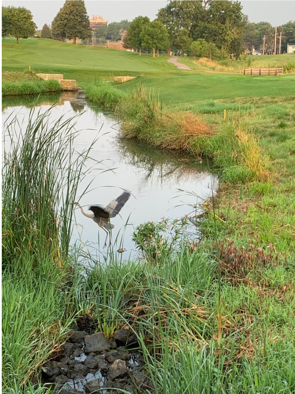
Figure 15. Stormwater collection pond from Middle Road. Pond located near #11 tee/10 green at Palmer Hills