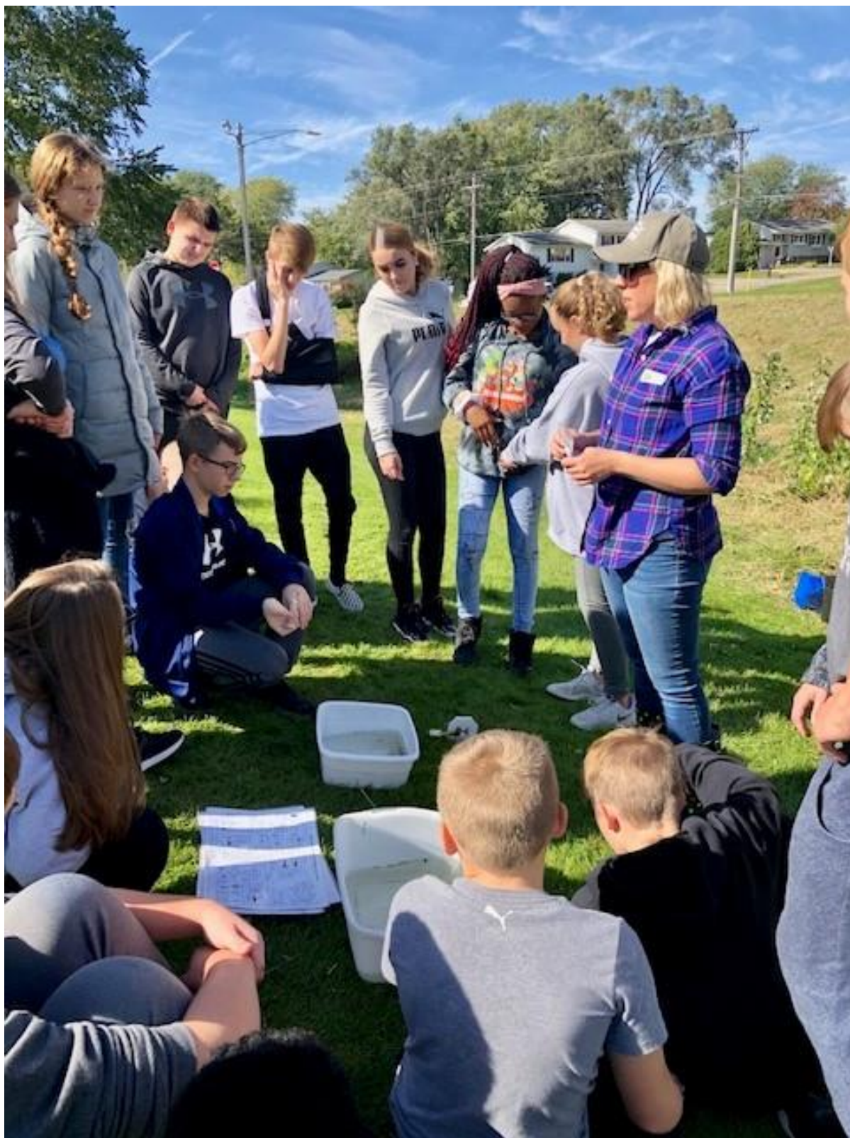
Figure 22. First Green 8th grade students water testing creek at Palmer Hills