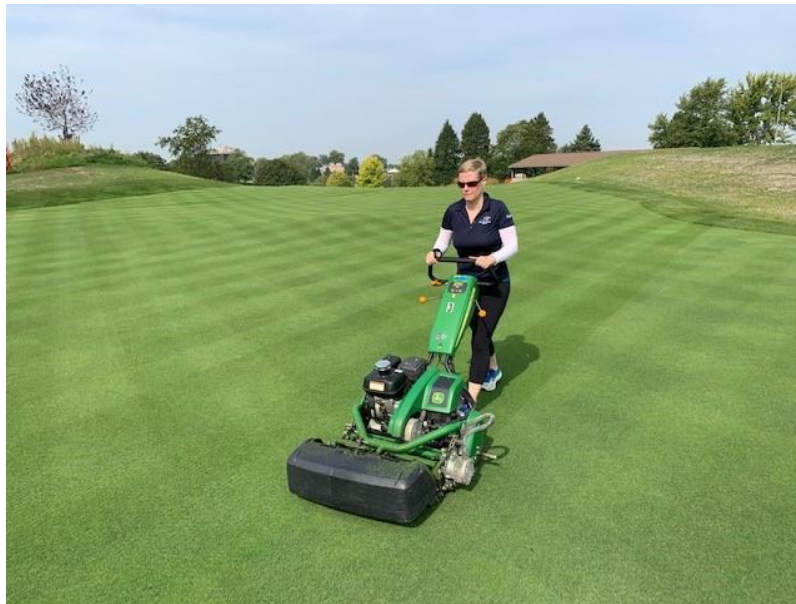
Figure 1. Grow-in of The Forge putting course.