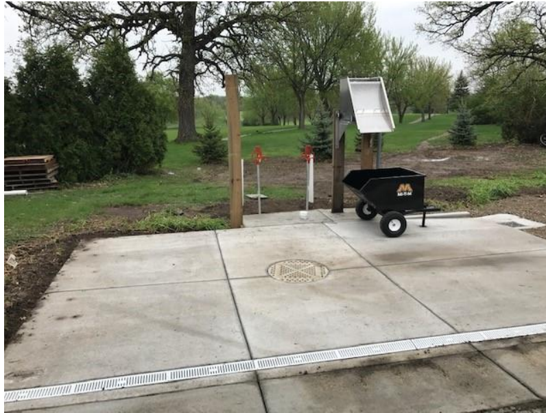
Figure 42. Designate a mix/load station to contain potential problems.