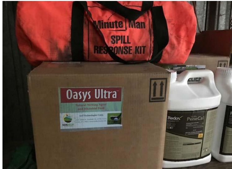
Figure 41. Have your spill response kit handy at all times.