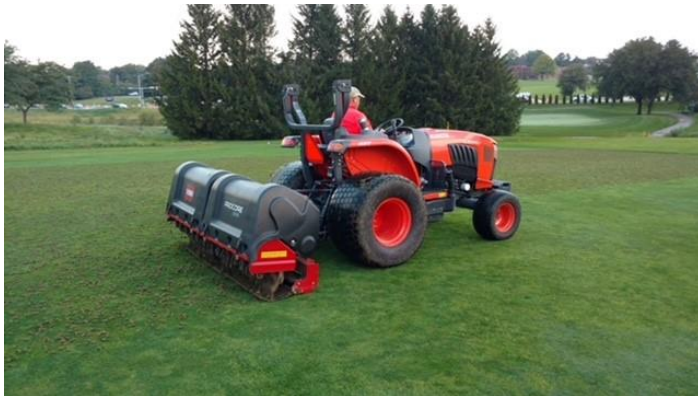
Figure 29. Fairway aeration at Palmer Hills