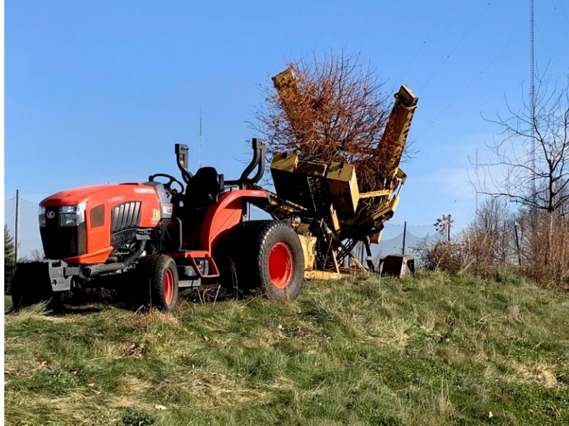
Figure 32. Planting native tree following our tree management plan