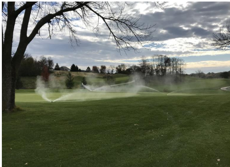
Figure 13. Get as much of the water out of the pipes as possible.