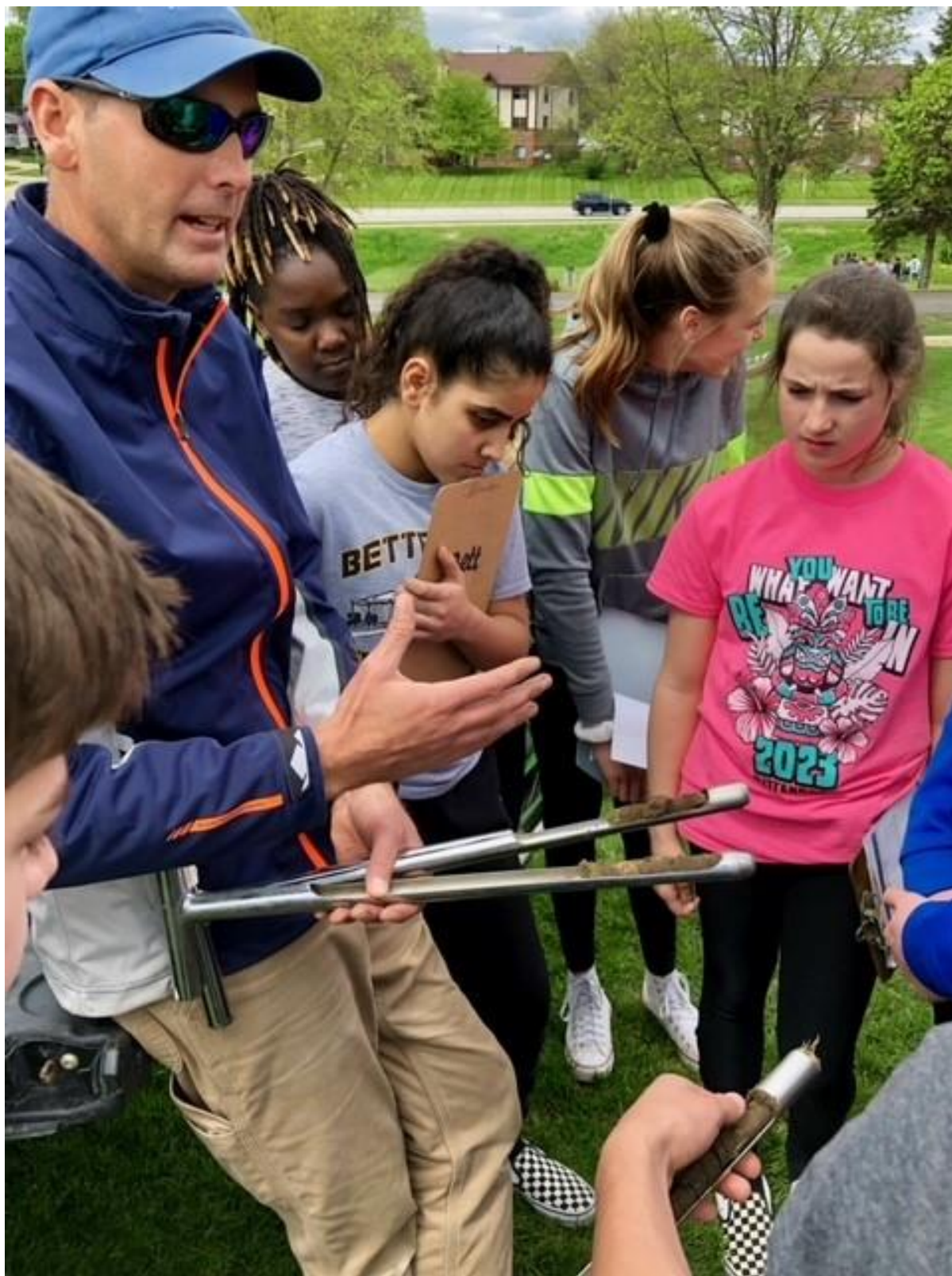
Figure 24. First Green program discussing soil samples at Palmer Hills