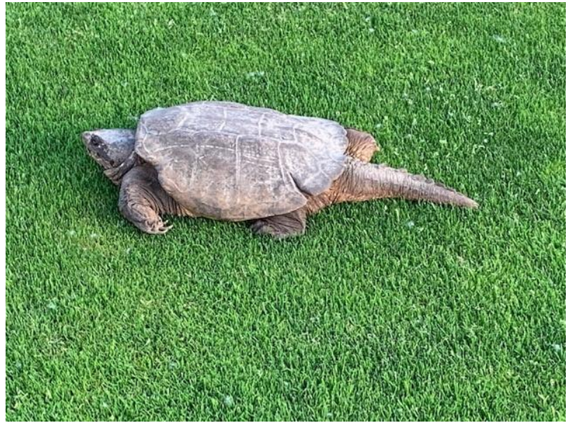
Figure 5. Snapping turtle crossing #14 fairway at Palmer Hills