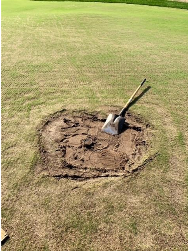
Figure 12. Leveling stealth sprinkler on putting course at Palmer Hills .