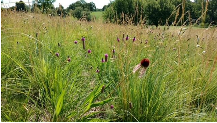
Figure 44. Native areas are beneficial for many species.