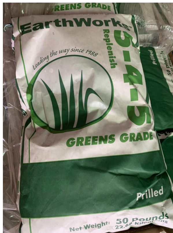
Figure 25. Organic fertilizer for golf greens at Palmer Hills.