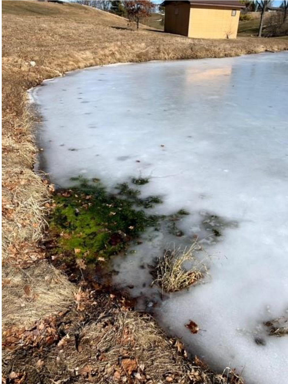
Figure 17. Algae growth in 14/17 pond at Palmer Hills