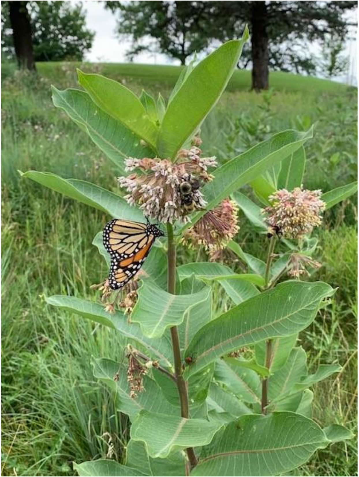
Figure 50. Milkweed in natural areas with bees and butterfly at Palmer Hills