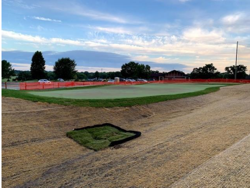
Figure 2. Straw is used to protect soil and seed from water erosion.