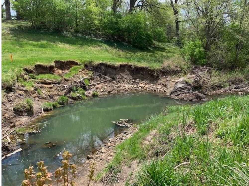
Figure 23. Stafford Creek erosion hole 14 before repair