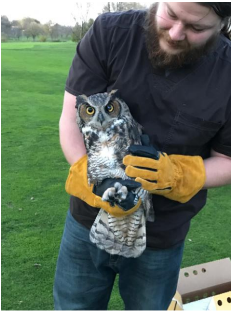
Figure 4. Great Horned Owl at Palmer Hills