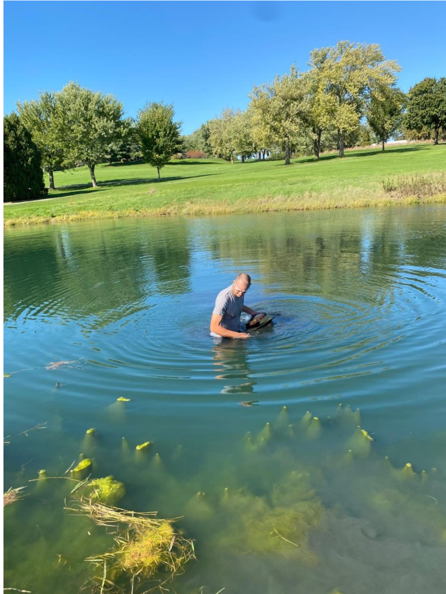
Figure 20. Pond aerator repair on hole 14/17 at Palmer Hills