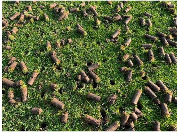
Figure 28. Core aeration alleviates compaction on fairways