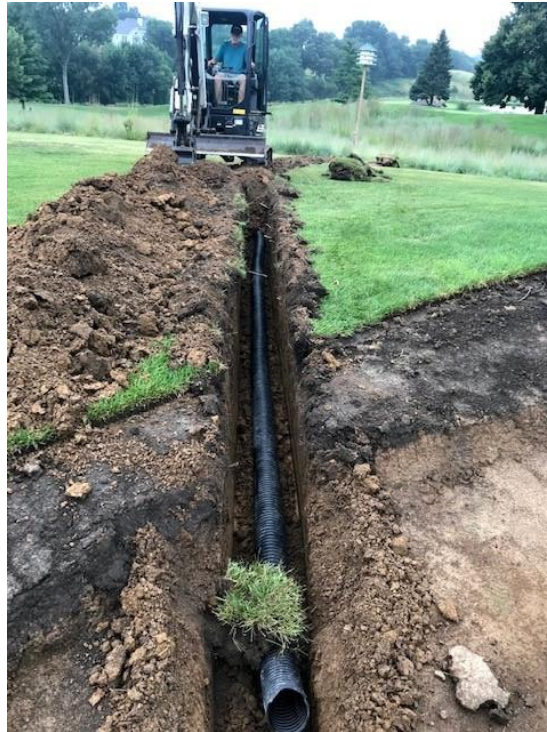
Figure 3. Bunker drainage installation. Discharge into native area hole 1 at Palmer Hills