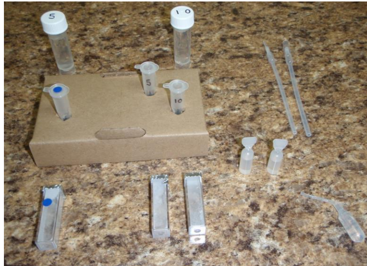
Figure 21. Water testing kit.